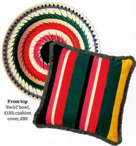
From top 'Swirl' bowl, £135; cushion cover, £85