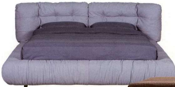
'Milano' bed by Paola Navone, from approx £10,287, Baxter (baxter.it)