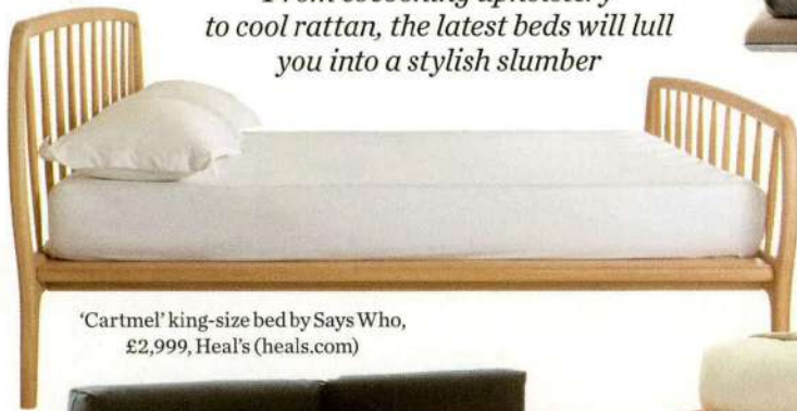
'Cartmel' king-size bed by Says Who, £2,999, Heal's (heals.com)

From cocooning upholstery to cool rattan, the latest beds will lull you into a stylish slumber