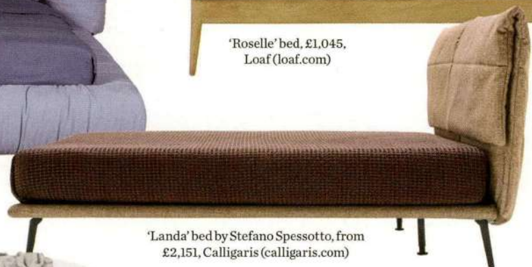
'Landa' bed by Stefano Spessotto, from £2,151, Calligaris (calligaris.com)