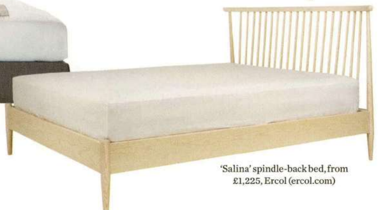
'Salina' spindle-back bed, from £1,225, Ercol (ercol.com)