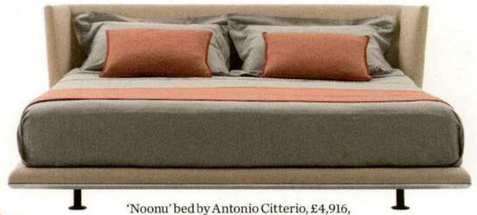
'Noonu' bed by Antonio Citterio, £4,916, B&B Italia (bebitalia.com)