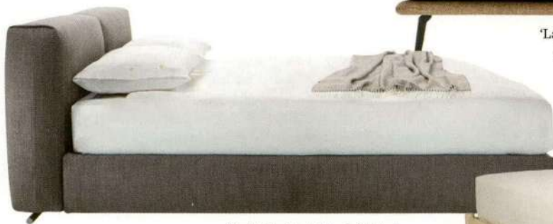
'Asolo' bed by Antonio Citterio, £5,887, Flexform (flexform.it)