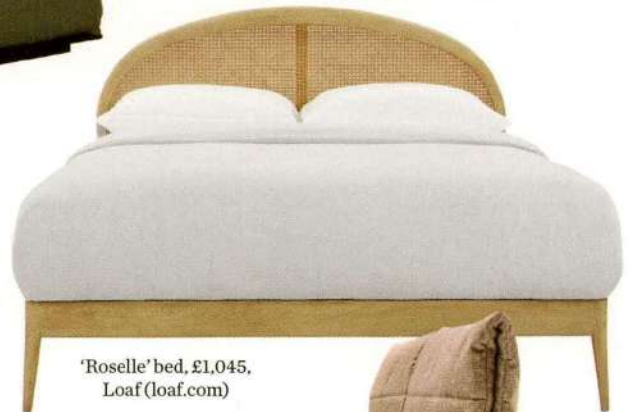
'Roselle' bed, £1,045, Loaf (loaf.com)